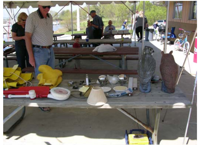
Nautical Flea-market Time!