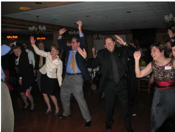
The BYC No-Boat was rockin' and rollin', as usual.

and privilege of serving as your Commodore this year. This is a fantastic club full of great friends. For those who do not know me, please feel free to stop by our boat, Serenity near the West end of Margaritaville and introduce yourself. I look forward to meeting you.