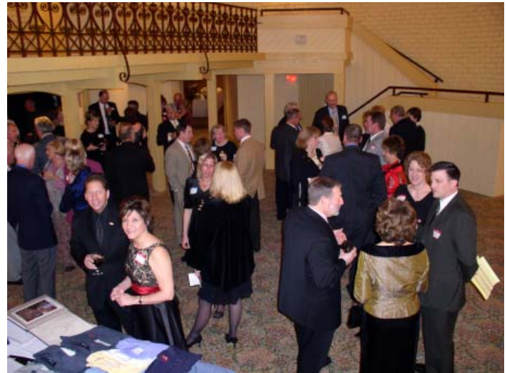
BYC No-Boat partiers socializing in the "cocktail room" prior to the activities in the main ball room.