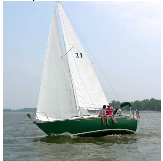
"Just Hanging Out"