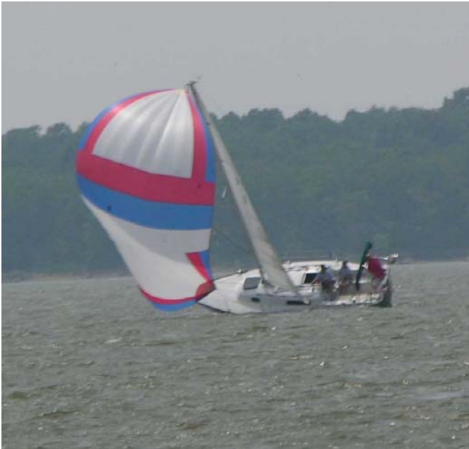
“Douse, Douse”