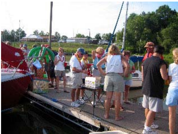
"Schmidt Village"