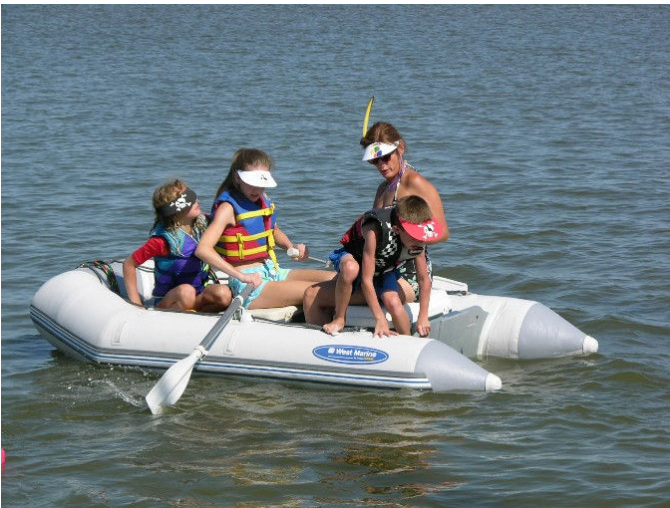
Where's the drain plug?