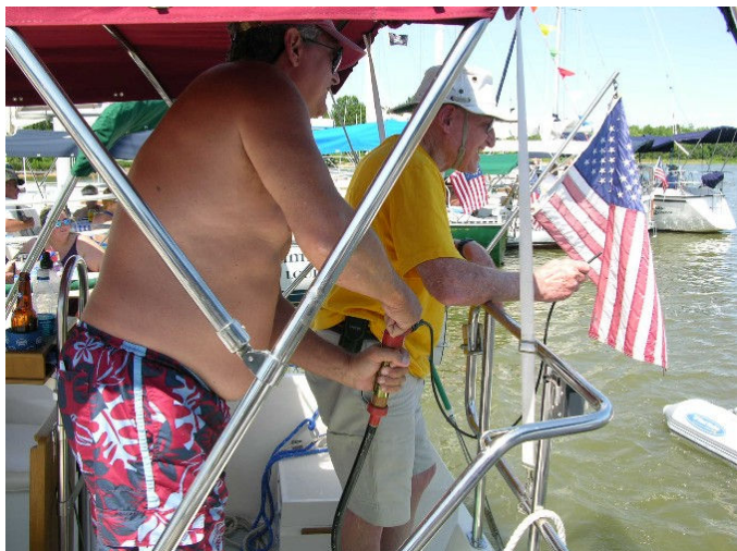
Volunteer firemen on duty