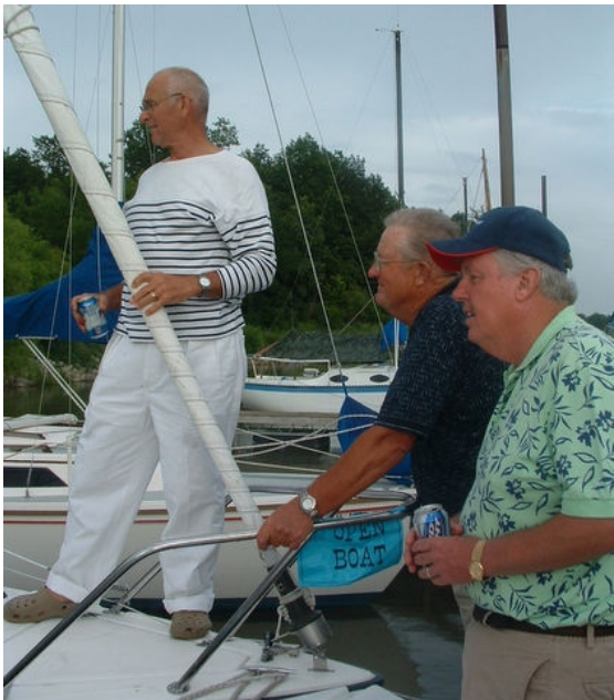
Aren't these some stately fellows? ☺