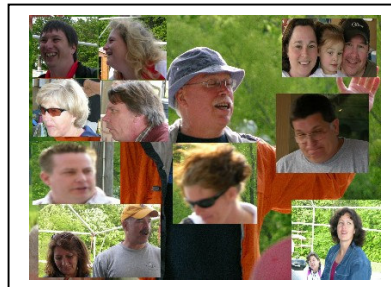
new members, greet them Learn their names & boats