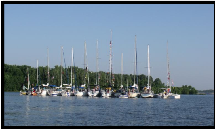
10 BYC Raft-Up in Cove One for the Fireworks.

If you have pictures of recent vacations you would like to share please E-mail your photos to me. I would like to post them in future articles.