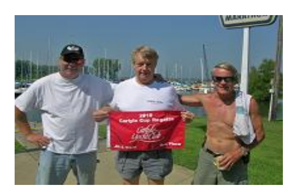
Carlyle Cup Regatta winners