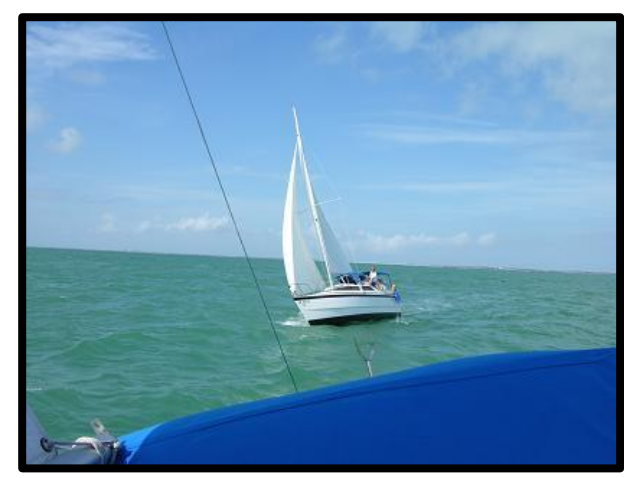
The Schmidt's and entourage enjoy the most southern point in the USA.