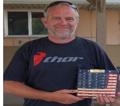
2 nd place

Nomad is finally in the water and has had her first shakedown sail. It's been an incredibly long winter, full of projects from 2 seasons' worth of maintenance items added to a list. In the process of ticking each one off we came on a couple of products and good service that we highly recommend.