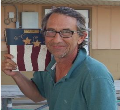
1 st place