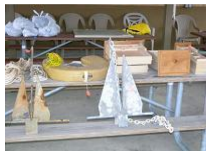
more flea market stuff