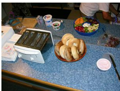
Spring thaw breakfast

Have you seen what the Commodore did in the clubhouse? →