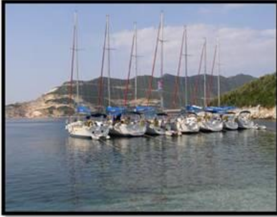
SunSail raft-up for a BBQ. Rafting -up without worrying about slipping.