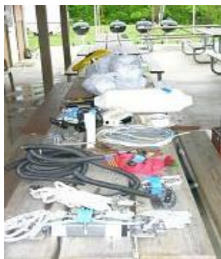
flea market stuff