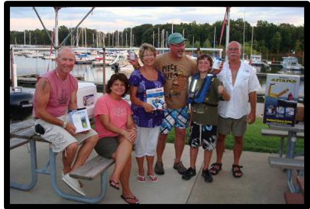
Congratulations to this year's winners!!