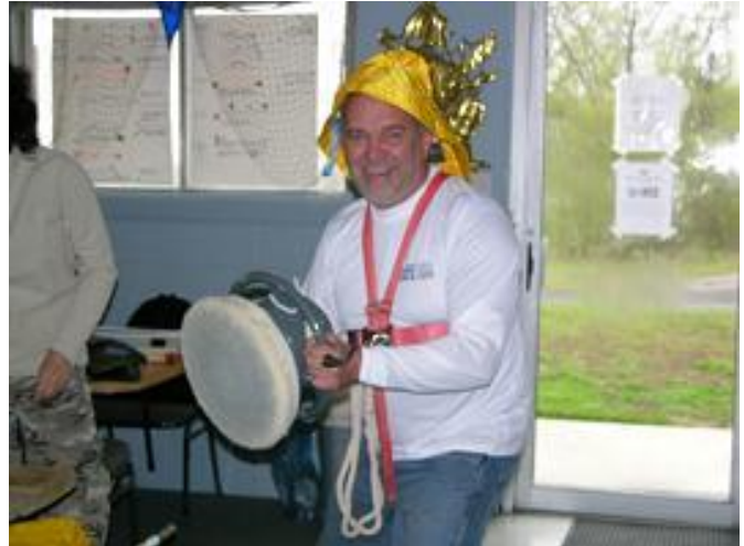
Yeah you wear it when waxing your boat