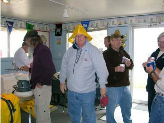
It's a rain hat