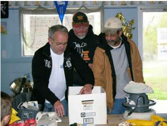
What is it?