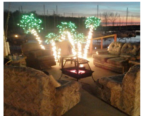
Our 4 new love seats in the club house.