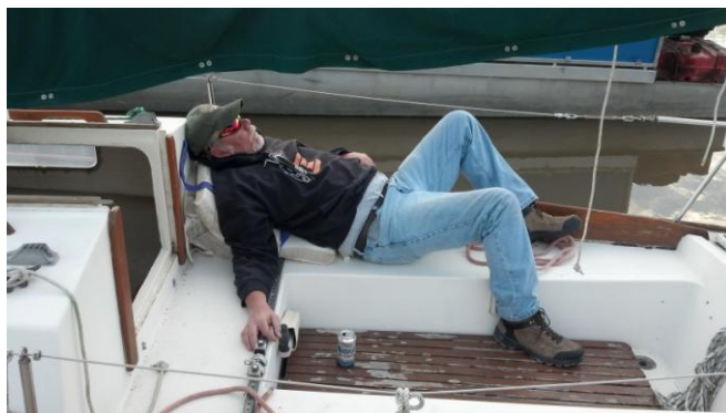
Managing a marina is hard work!