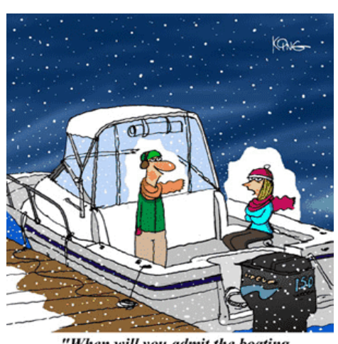
"When will you admit the boating season is over?"