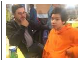
Nov. who am I