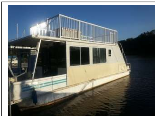
Feb. who am I