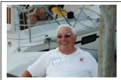
March who am I