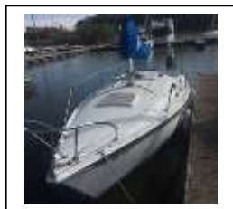
Sept who am I