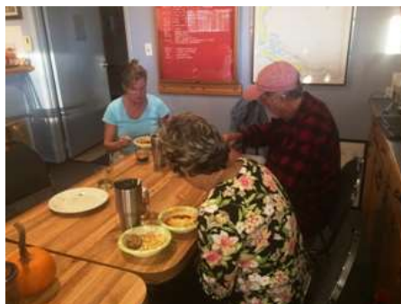
Nov. who am I