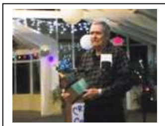
Jan. who am I