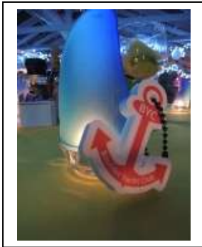
2017 NO B0AT