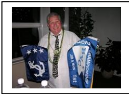
June Who am I