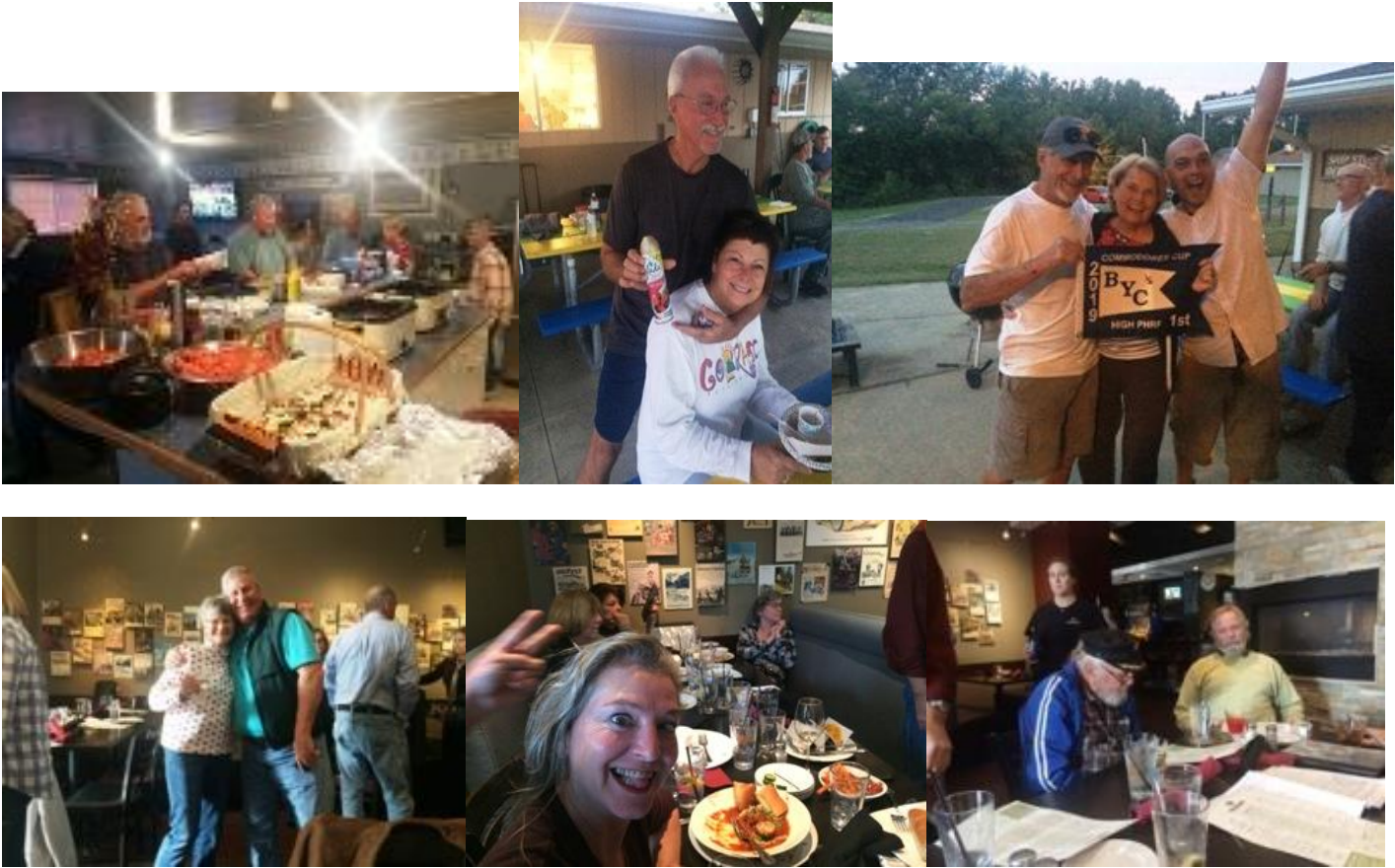
2018 Ladies Luncheon