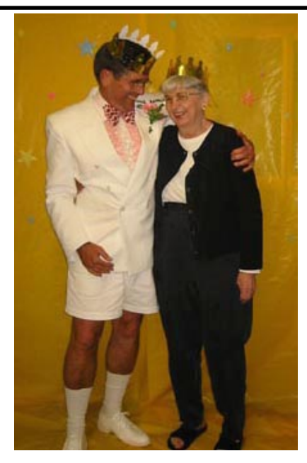
The King and Queen

I am looking forward to our Flag Day Fest on