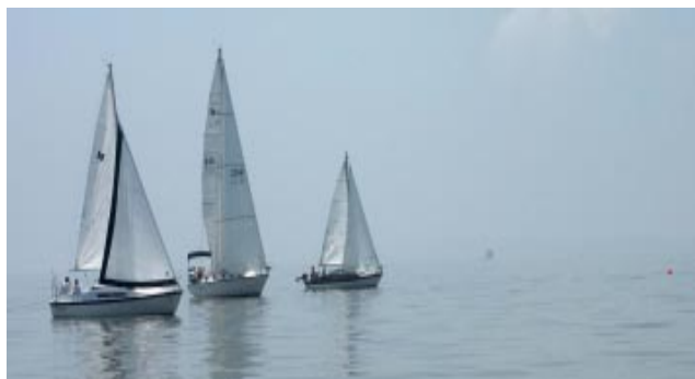
In a hotly contested start, Tiburon streaks for the line.