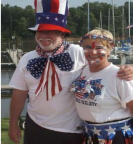
Who said BYC doesn't have the finest looking members on the lake?