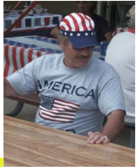
Where'd you park your hog, Cpt. America?