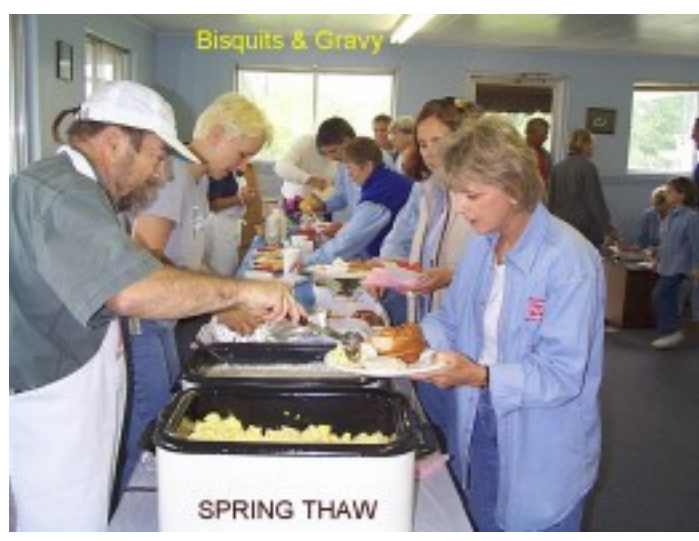
Hungry sailors grab some first rate chow at the Spring Thaw.

The Boulder Trade Winds brought in Spring Thaw, sailors and a small amount of treasures.