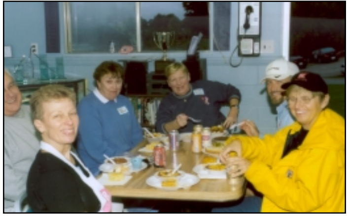
Grey skies outside don't dampen the spirits of this enthusiastic

As in every year it would not be possible to put on the Chili Supper without the many volunteers who come forward