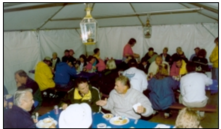
With the tent up and the side curtains in place, chili supper diners are oblivious to the tempest raging outside.

I, therefore, am asking the help of all members to submit nominations (anonymously, of course). Your nomination should include the name of the individual and the deed they performed that merits special recognition by the yacht club general membership at the No-Boat. Make nominations directly to me either by e-mail (tdimercurio@celsis.com, tdimercurio@earthlink.net), snail mail or phone call (314-487-6776 office or 636-296-1059 home) Please limit your nominations to deeds performed in the operation of sailboats. (Getting caught by the state police driving home from the lake naked with a cocker spaniel in the car does